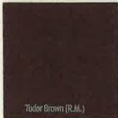
Tudor Brown (R.M.)

ATTENTION: Please read the following attached documents for more information regarding building colors in the Special Treatment Overlay Zone (Historic District):