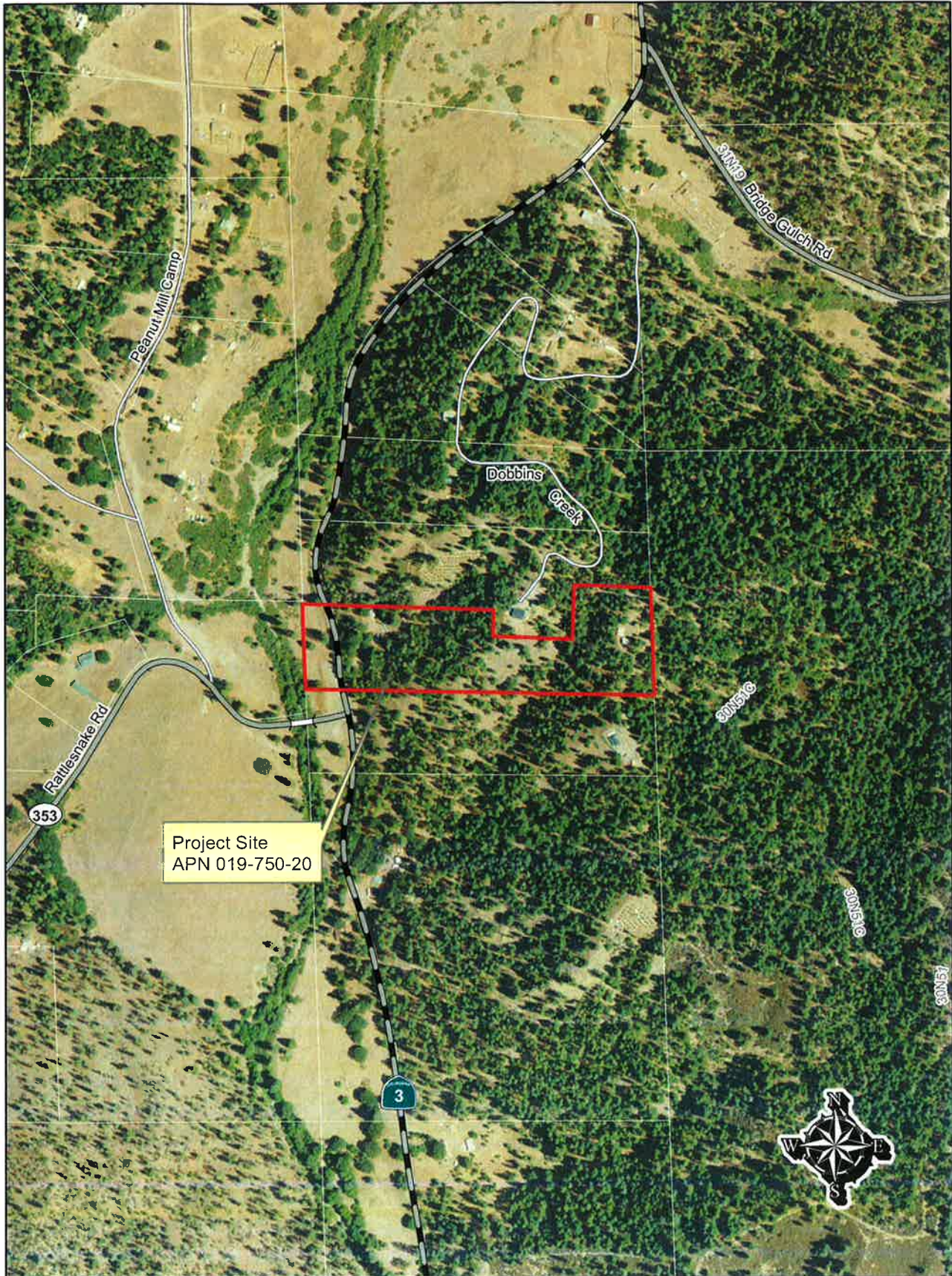
FIGURE 1 6