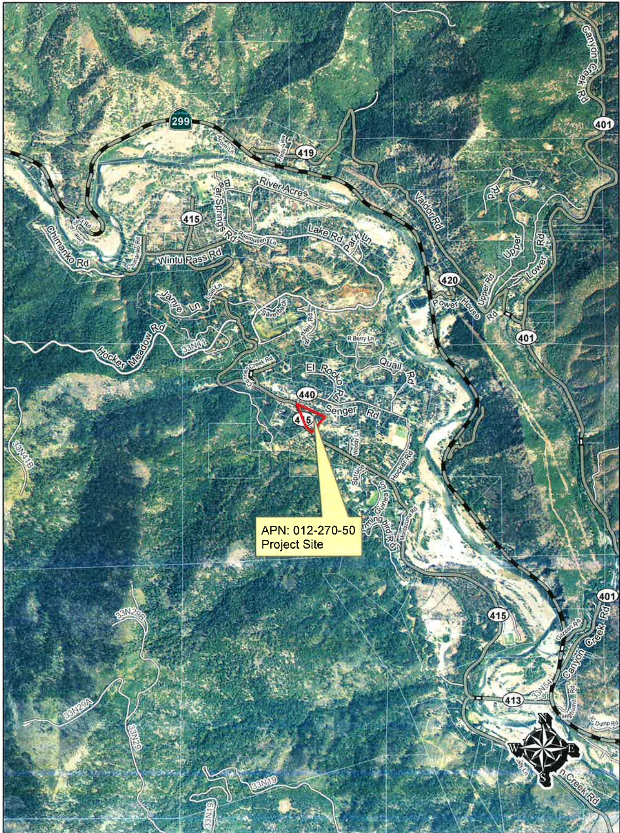
FIGURE 1 -PROJECT LOCATION MAP P-17-49 - E. Wisniewski - CCL Variance Request