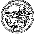
EXHIBIT A CEQA CIRCULATION DOCUMENTS

EDMUND G. BROWN JR. GOVERNOR December 15, 2017