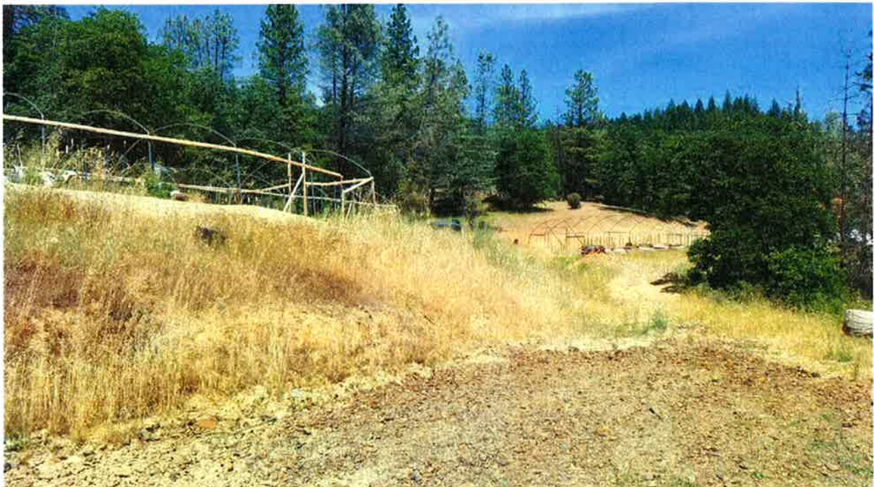
Picture 4: facing north-east near the residential dwelling toward the class III watercourse drainage and access road