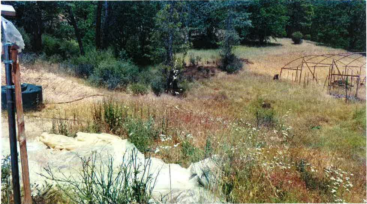
Picture 3: facing north-east towards the class III watercourse that separates the Site 1 and Site 2 designated cultivation areas