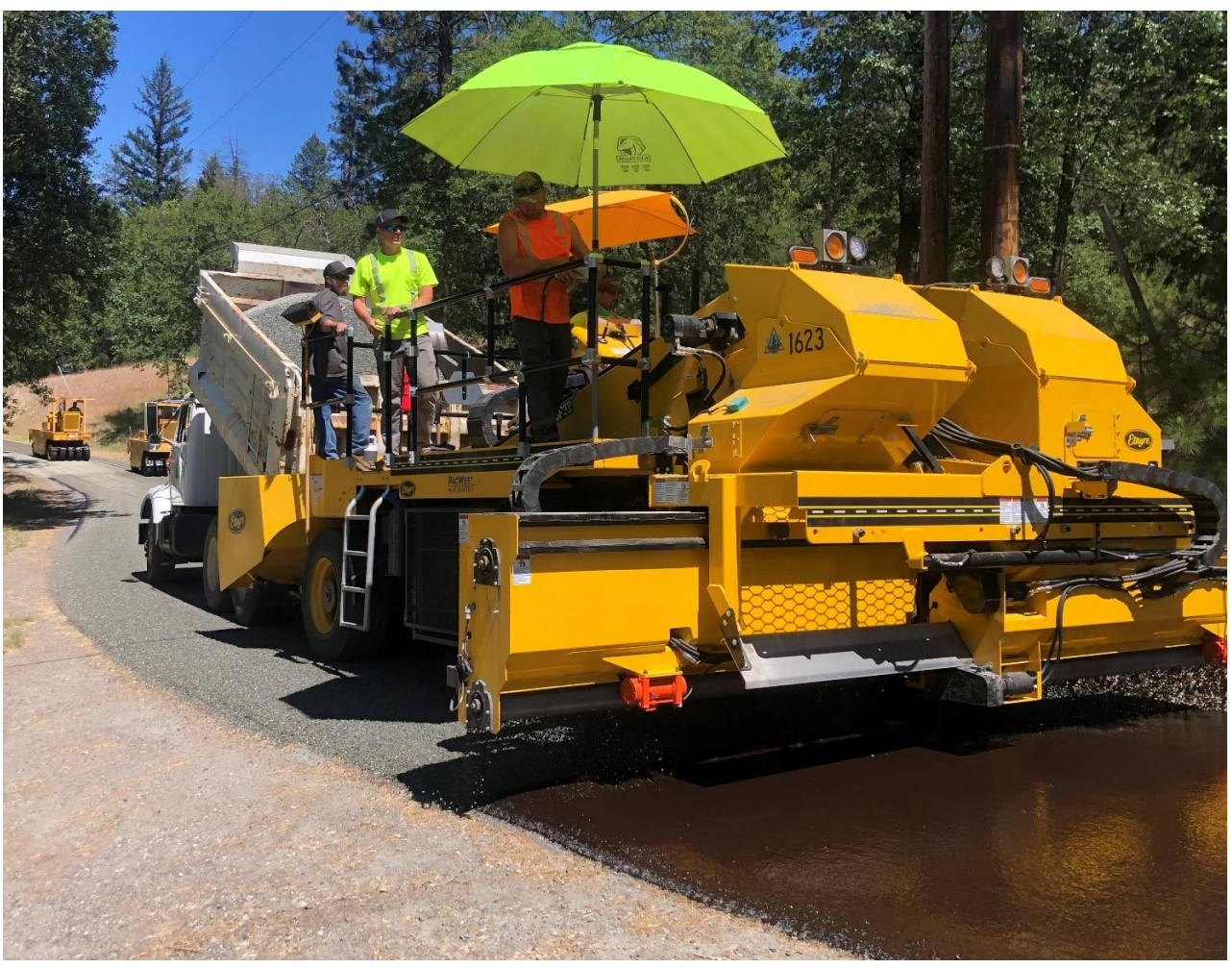
Chip Seal operations by County crews on Mountain View Drive