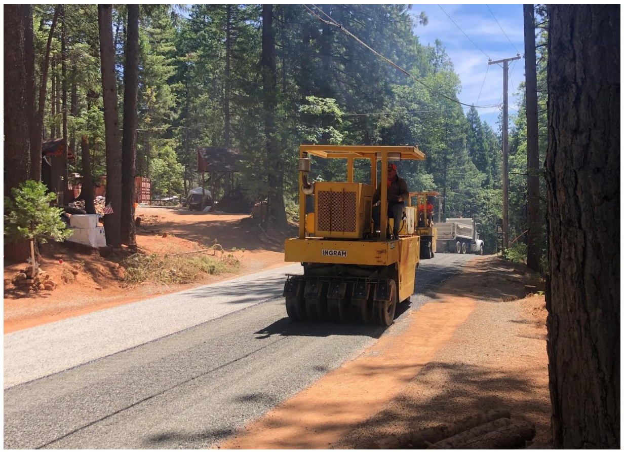
Chip Seal operations by County crews on Lake Forest